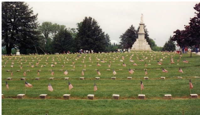
Picture of Gettysburg Cemetery

And it was during that trip, that they came together as a team. And it was really because of one of their early morning runs, when they came upon the graves of 50,000 men at Gettysburg. It was here that they would come to truly understand why their calling was important.