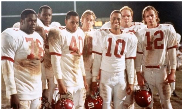
Picture of football team from movie